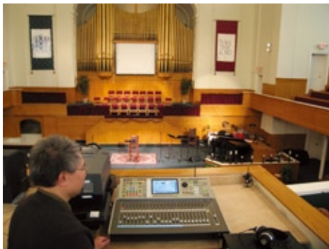
Art Yeap with the V-Mixing System.