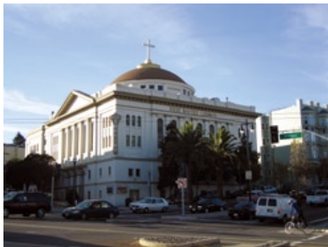
First Baptist Church of San Francisco. Built in 1849.