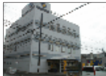
▲Toyohashi Cable Network