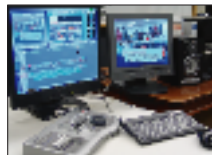
▲DV-7DL PRO SE