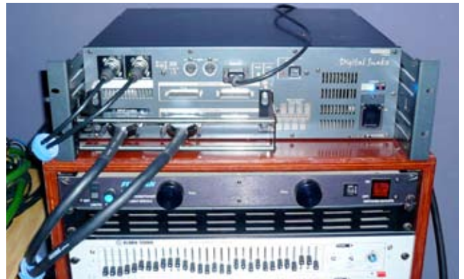
S-4000H in FOH