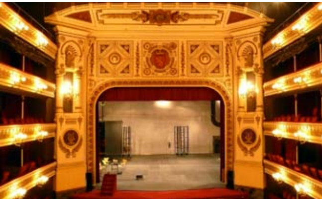
Overview of theatre

Our basics needs were: to update the whole communication system without damage to or modification of the theatre's original structure and avoid using the old audio communication tubing, for this reason the selection of the cable CAT5e was a succes owing to its easy camouflaging within the structure of the theatre. Obviously, besides these needs, the most important point was, of course, high quality sound with total control from a distance of the pre-amplification zipper free (without steps in gain), without noise or R.F. in the signal. Another important point was to solve a typical theatre problem that is, the flexible location of the stage unit or FOH, for example, throughout the theatre with various RJ-45 points we can connect to a S-4000S Stage Unit with one or various FOH S-4000H units according to each show's need.