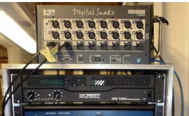
S-1608 in the machine room, along with Power amplifiers