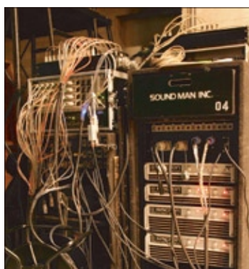
▲S-4000S in Rack