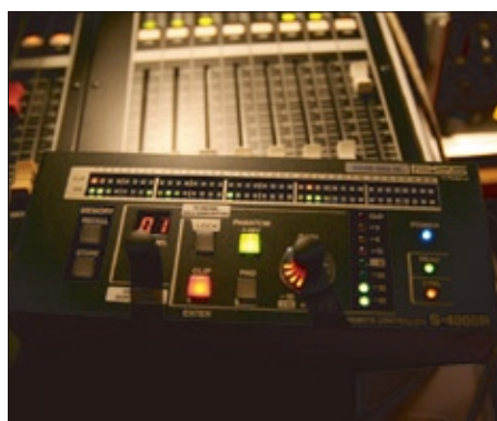
▲S-4000R on mixing table