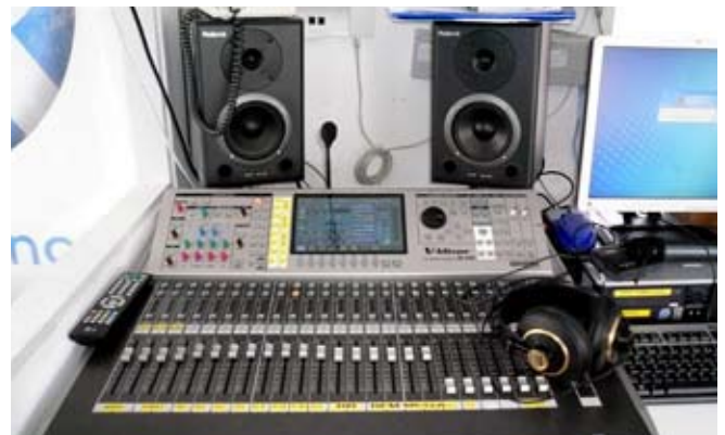
V-Mixer M-400 in main control area