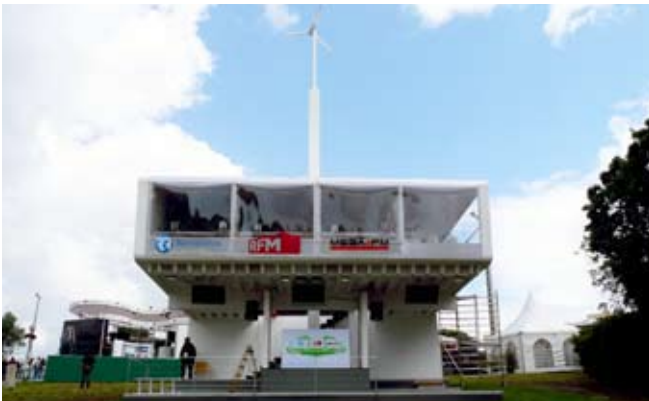
Radio Renascença installations in Rock in Rio

We got to know these systems during a Roland Systems Group workshop in Lisbon and in which we realized that we were looking at the solution to our problems, for the imminent arrival of the principal music festival held in Portugal, with internationally famous artists like: Bon Jovi, Lenny Kravitz, Amy Winehouse, Tokio Hotel, Metallica and up to 50 artists during 5 days. Rock in Rio is an important challenge for us, for its complexity as well as the large repercussion that this festival has in the country and where the ratings are very high during the festival. Once our requirements were planned, we worked in collaboration with the Roland team on the design of the work environment that necessary for this big event. Our surprise was the facility of integration and the easy handling of the system. Our operator were the ones who enjoyed it the most both in the easy assembly as well as in the time saved from not having to read a tedious instructions manual just a few hours before a festival like this. The system is very easy and offers; in addition to quality, highly professional features. We simply say this: RSG by Roland in Broadcast, why not?