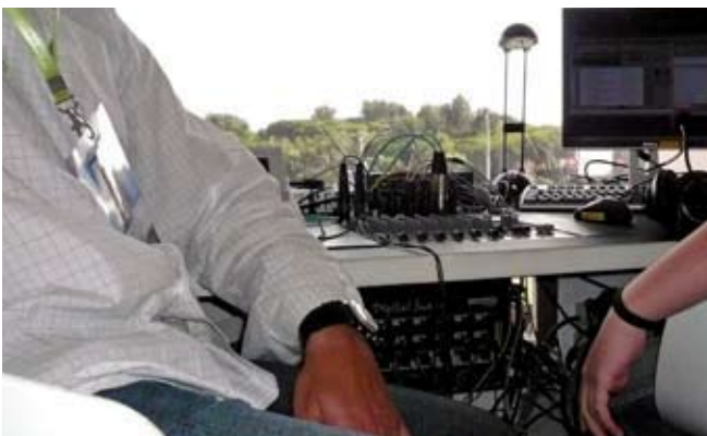
S-0816 located in one radio cabin