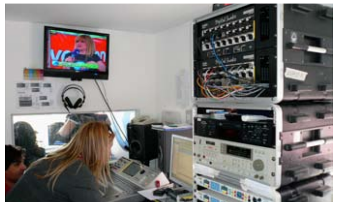
V-Mixer M-400, S-1608 & S-0816, in main control