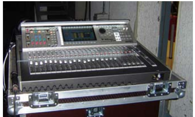
The V-Mixer, M-400 in a set's corridor