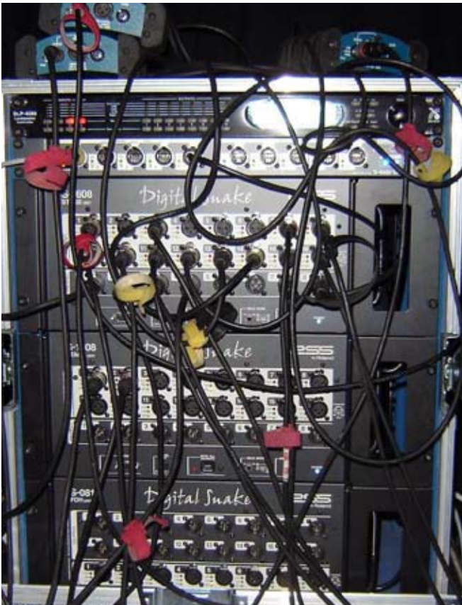
2 S-1608, S-0816 and S-4000SP situated in channel TV set

Furthermore, it might happen that the guest is a musician and that he also plays live. All of this has to be mixed and sent to the central control for its broadcasting. Since daily everything has to be disassembled after the program and the following week everything has to again be assembled, we needed a system with many integrated, effect type features, compressors and more, with high quality sound, being able to send to different long distance points and all of this is an accessible format, in order to situate the equipment on the set, without noises or parasites in the signal. We have many systems available in our installations, but the V-Mixer, due to its incredible features and quality, has been consolidated as a mix system.