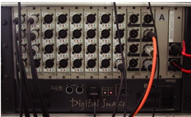
8 inputs + 3 outputs with talkback