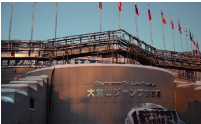
Ohkurayama Ski Jump Stadium