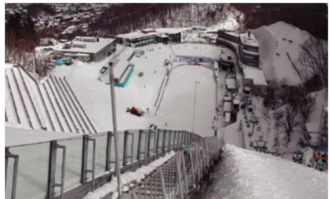
Looking down from judge tower