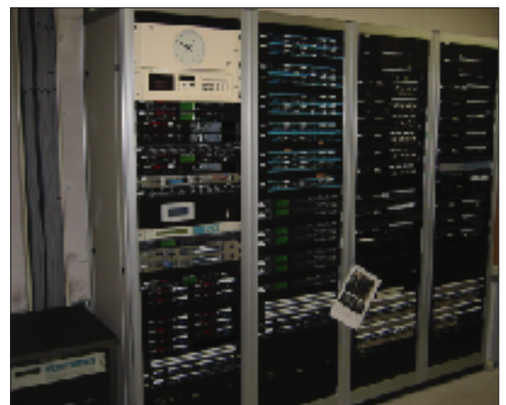
▲Equipment in Rack