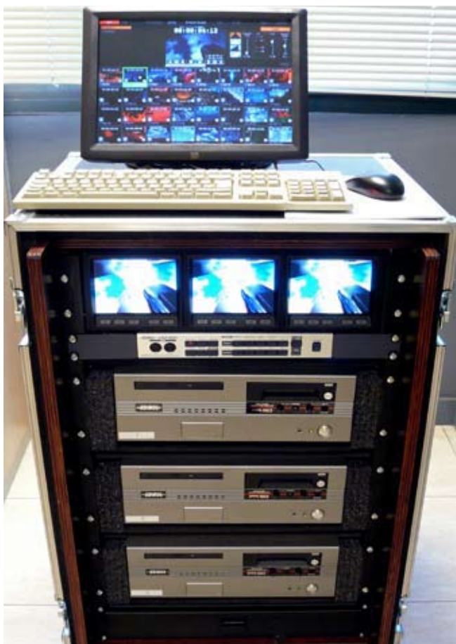
Video rack of the show, including 3 Edirol PR-50 controlled by touch panel display

We are already familiar with the quality of the Edirol products. In our productions we often use the V-440HD multi-format video mixer and it is spectacular. When we posed the video part of the musical, we had to take the moving of video equipment through the whole country into account and we didn't want to be repairing it or changing it. We commented our needs for the musical to Roland staff and they suggested the use of the PR-50. The election was a total hit. Total stability, easy use, image quality, apart from an interesting price, this was all we needed. The units work perfectly and the image synchronization is incredible. Furthermore, we can easily solve a requirement of being creative, to be able to send to the projectors, in real time, image contents to a full 3x1 screen, or independent content to each screen, all of this without video matrixes.