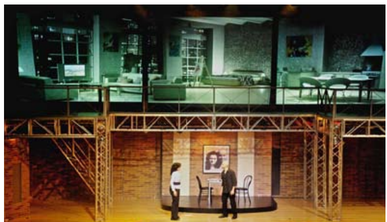
System details on multi-screen during the show