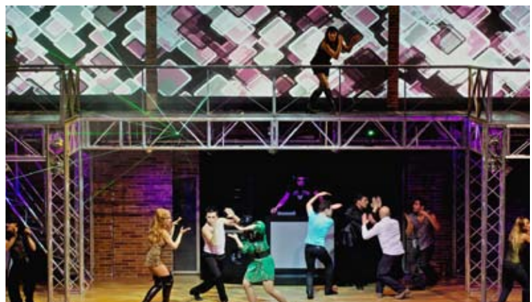
The system on independent screen