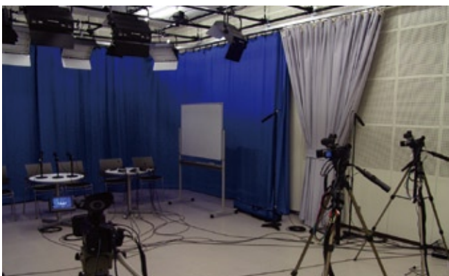
Chroma Key Studio