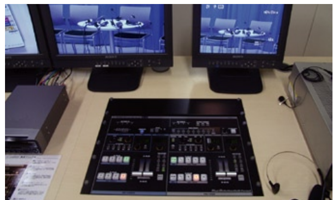
V-440HD in use