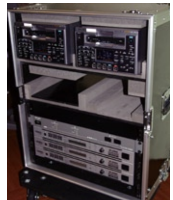
Capable for outdoor use