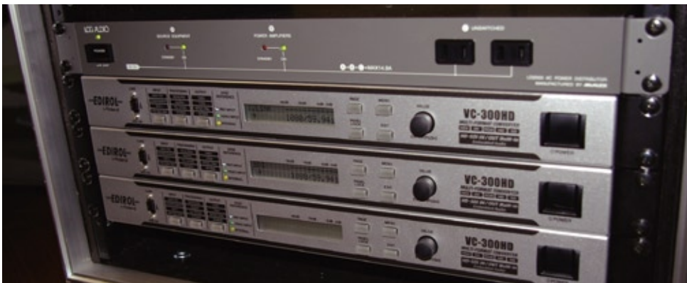
VC-300HD x 3 units installed in rack