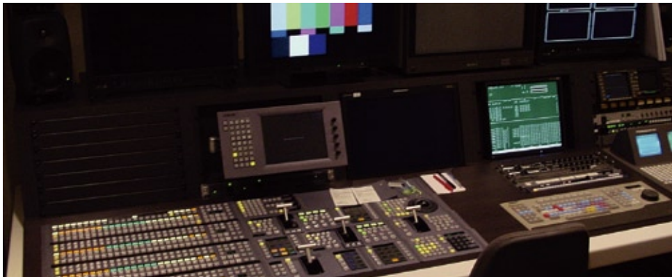
The Linear Editing Suite to create Karaoke video contents

Daiichi Kosho Co., purchased 3 VC-300HD to use with 3 HD-SDI cameras. The signal from each camera is split to SDI and HDV. The SDI streams go into the video mixer for master output. HDV streams are recorded to VCR as backup. VC-300HD has the ability to simultaneously record high quality HDV and output HD-SDI at the same time in a single unit.